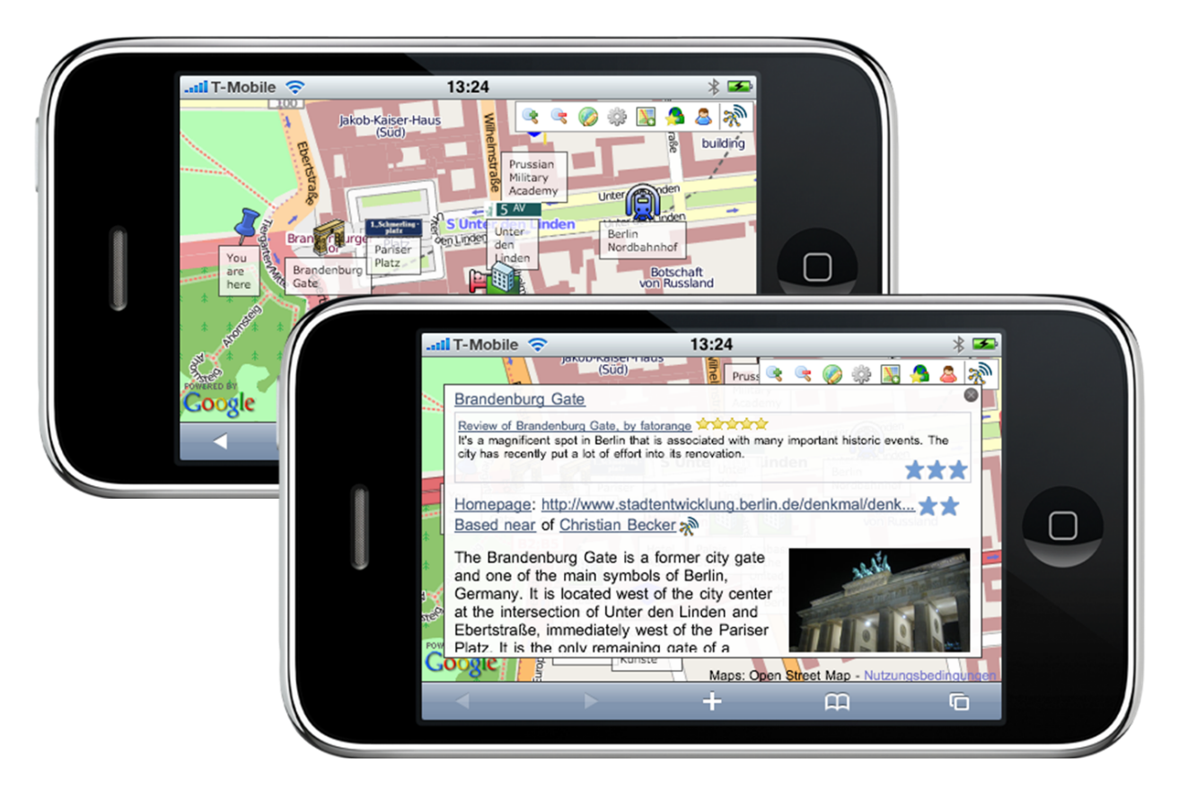
Figure 5. DBpedia Mobile displaying information about Berlin

tourist exploring a city. Based on the current GPS position of the mobile device, the application provides a location-centric mashup of nearby locations from DBpedia, associated reviews from Revyu, and related photos via a Linked Data wrapper around the Flickr photosharing API. Figure 5 shows DBpedia Mobile displaying data from DBpedia and Revyu about the Brandenburg Gate in Berlin. Besides accessing Web data, DBpedia Mobile also enables users to publish their current location, pictures and reviews to the Web as Linked Data, so that they can be used by other applications. Instead of simply being tagged with geographical coordinates, published content is interlinked with a nearby DBpedia resource and thus contributes to the overall richness of the Web of Data.